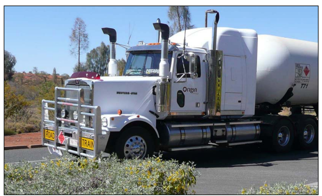
Figure 1: Roo Bar

The issue of moose bumpers has now arisen. A moose bumper is a substantial structure fitted to the front of a truck or tractor and designed to protect the front of the vehicle, especially the radiator, in the event the vehicle collides with a large and heavy animal, like a moose. A similar device intended to deflect kangaroos in Australia is known as a roo bar, and is shown in Figure 1.